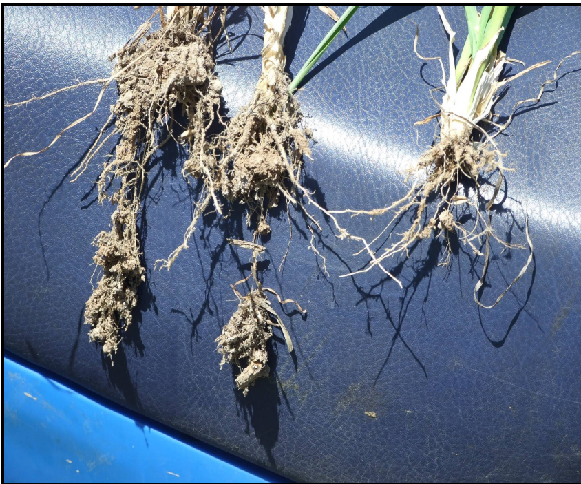
Fig.2. The two wheat plants on the left were grown with perennial grasses in a Pasture Crop treatment while the wheat plant on the right was grown in adjacent bare soil, amended with 100kg/ha DAP.

Note the little lumps adhering to the roots of the Pasture Cropped wheat (Fig.2). These clusters are formed by microbes utilising liquid carbon from the roots. Microaggregates, too